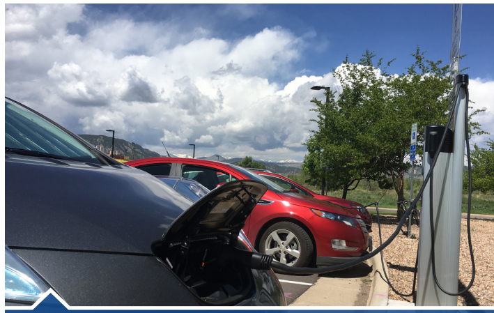
More fast charging stations are needed to encourage widespread adoption of electric vehicles.

Promote other clean modes of transportation like EV carsharing, electric buses and walking, biking and transit in order to encourage clean travel without requiring EV ownership.